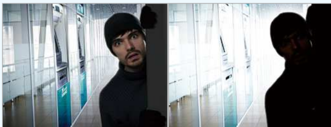
With WDR Pro